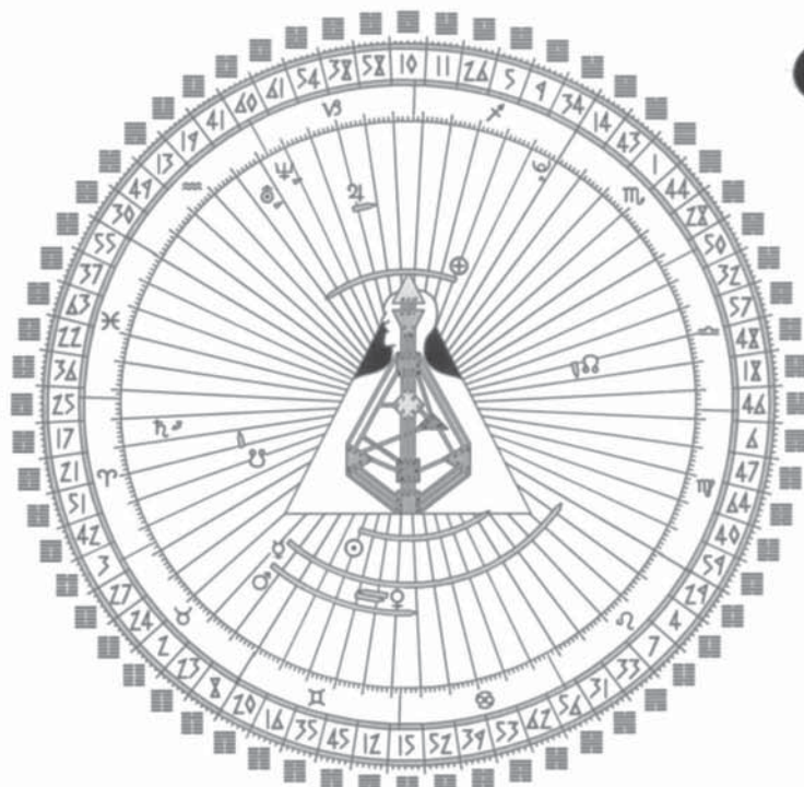
The planetary movements June–July

The Nodes move in a clockwise direction, while planets move counter-clockwise. They always activate a pair of opposing gates. Now the Nodes activate the Libra/Aries axis.